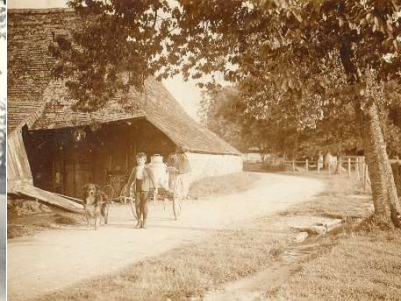
on the way to the cheese dairy