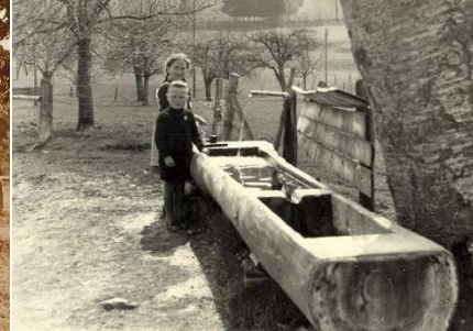
fountain in front of the house

In 1992, a fire destroyed the house. The farm building was rebuilt from scratch. The buildings on the south side were untouched by the fire, and you can still see the remaining part of the barn entrance.