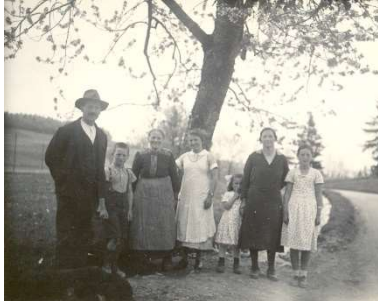
family of the owner around 1920

We extend to you a warm welcome at «Duerrenberg», a house that used to be a farm, settled on the Laengenberg, a small mountain range of the Pre-Alps between Bern and Thun.